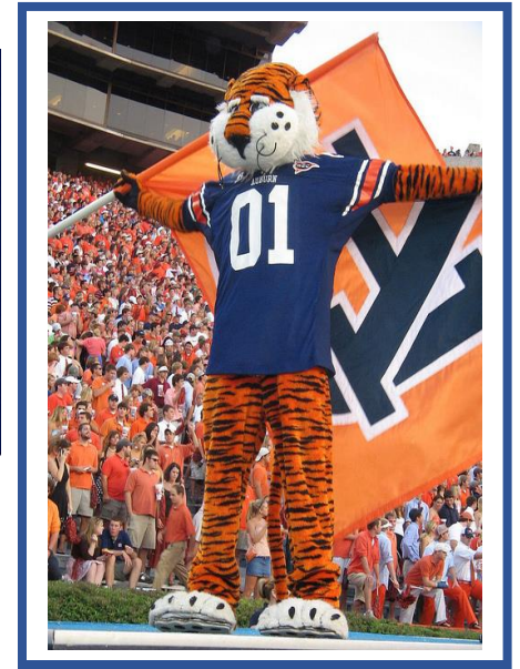
WARRRRR EAGLE, HEY!

Other states boast a game that generates a passion like no other and loyalties run deeper than any bloodline. This game has become this state's great divider with the winner having the bragging rights for the next 364 days.