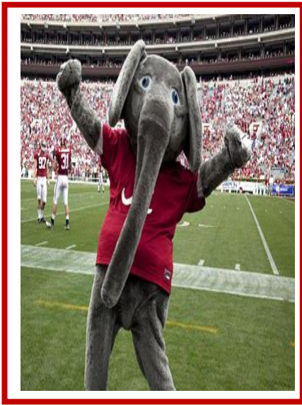
ROLLLLLL TIDE ROLL!